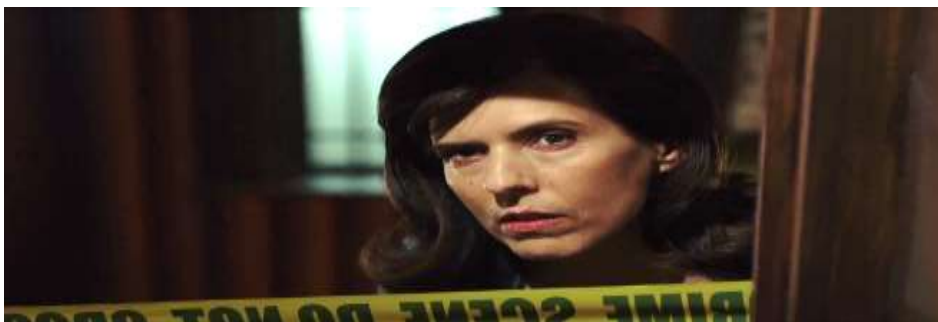
Picture 4. Fran watches Ransom fiddling Martha's medical bag

The investigation regarding the witness that happened in the Knives Out movie is shown by two character named Fran and Jacob. Witness regarding Fran can be seen in the conversation below.