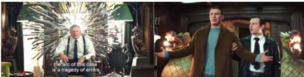
Picture 6 & 7. Detective Blanc reveals the solution

The action in a classical detective story focuses on solving the mystery of the crime, so the announcement from the detective that he has arrived at a solution to the crime is a climactic moment of the story. The announcement of the solution is the point at which the detective has solved the mystery of the crime after carrying out various investigations and gathering evidence in the field. Apart from that, it is at this point that detectives usually take the initiative to fight criminals, and at the same time it is the beginning of the completion part of the story.