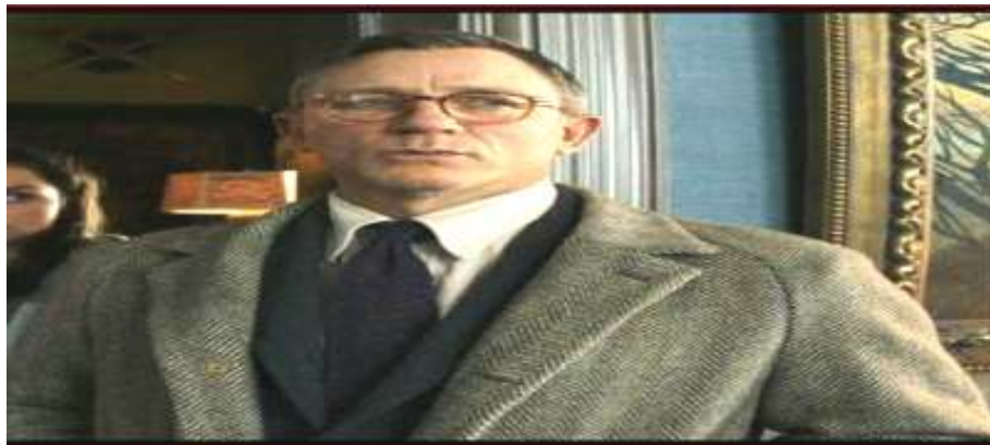
Picture 11. Detective Blanc character