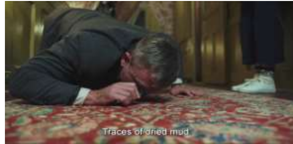
Picture 3. Detective Blanc found broken trellis and trace of dried mud

Detective Blanc: On the night of the party, somebody did not want to be heard climbing those steps went to a great deal of trouble to break into Harlan Thrombey's room.