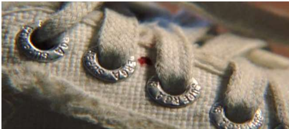
Picture 12. Martha's shoes

The conversation above shows how well detective Blanc's deduction skill is. Detective Blanc is able to correctly come to a conclusion regarding a secret that Richard did not confess to during the initial interrogation. He knew that there was something odd about Richard's answer, which he seemed to be trying to cover up. Detective Blanc gets a tip from the caterer who didn't see Richard helping with the food the day before the birthday party, but the caterer overhears Richard in Harlan's office arguing with Harlan. In the conversation the caterer was listening to, he heard a word that went "You tell her or I will". From hearing this catering, detective Blanc immediately concluded that Richard was having an affair with another woman. To prove his conclusion correct, Detective Blanc somewhat harshly tries to use Martha's compulsive vomiting which he has heard from rumors that Martha has a physical reaction disease if she thinks or tries to lie then she will vomit. The purpose of this detective blanc is to hear what he wants to hear about Richard's previous problems with Harlan, which in the end were all revealed through Martha.