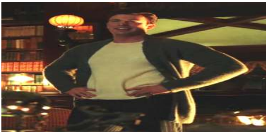
Picture 10. Ransom's personality

A criminal in a detective story is described by criminal acts that have complicated motives and their actions are interesting to the story. Their actions must be defined as evil or always bad in the eyes of others. A story in the classical detective usually presents the criminal as the enemy of a good character or detective. In Knives Out movie, it is explained that there has been a mysterious murder by Harlan. The criminal, in this case, was known by the detective character that Ransom was the perpetrator of the crime.