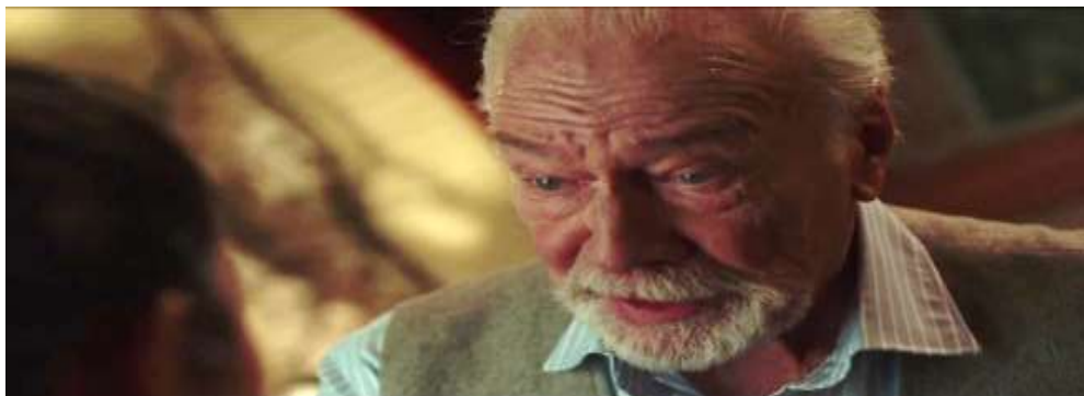
Picture 9. Harlan's flashback